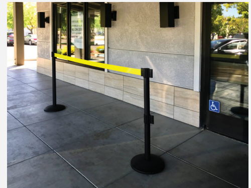
INDOOR OUTDOOR USE