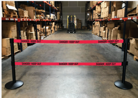
DUAL BELT OPTION