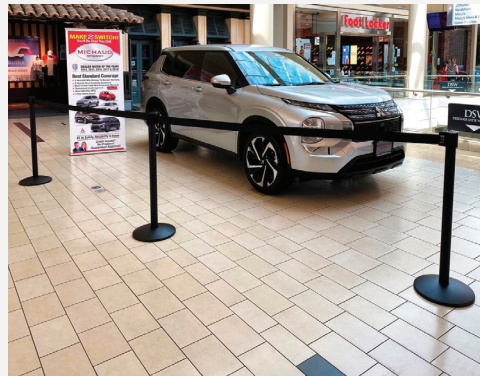
SINGLE BELT OPTION